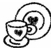
"Real Plates" Ministry