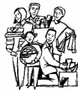
Food & Shower Ministry